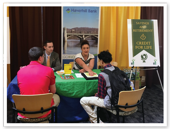
Haverhill Bank staff discuss budgeting and savings with Haverhill High School students.

Each year, Haverhill Bank partners with Haverhill High School to present the Credit for Life Fair for students enrolled in the school's Financial Literacy Program. The Fair, in its fourth year, simulates real-life budgeting scenarios and is run by HHS teachers, Haverhill Bank staff and other local