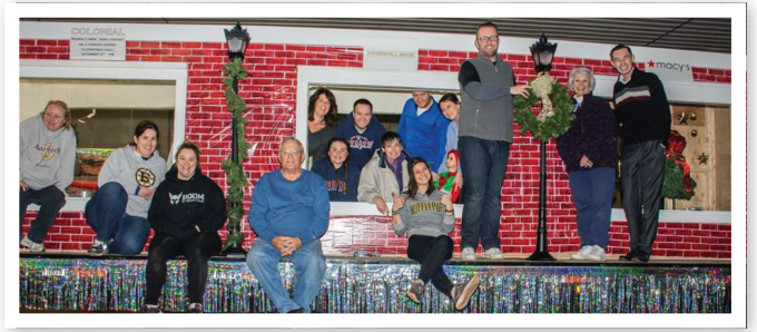
Haverhill Bank employees take a break from building the Bank's float for the VFW Post 29 Santa Parade. Every year the Bank sponsors, designs and marches with the float that brings Santa into town.