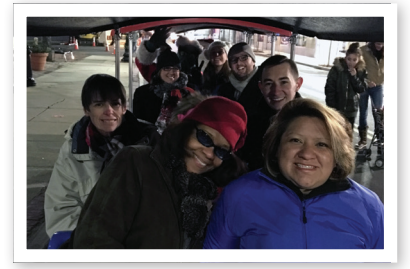
Greater Haverhill Chamber of Commerce Christmas Stroll